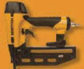
FNI664K 16 Gauge Finish Nailer

For nearly 40 years, Stanley-Bostitch has designed its products to be the most reliable & durable pneumatic tools available. Maybe that's why more finish carpenters and serious woodworkers rely on Stanley-Bostitch products more than any other major brand.*